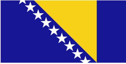
BOSNIA AND HERZEGOVINA