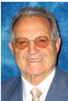
Olegario Vázquez Raña ISSF President